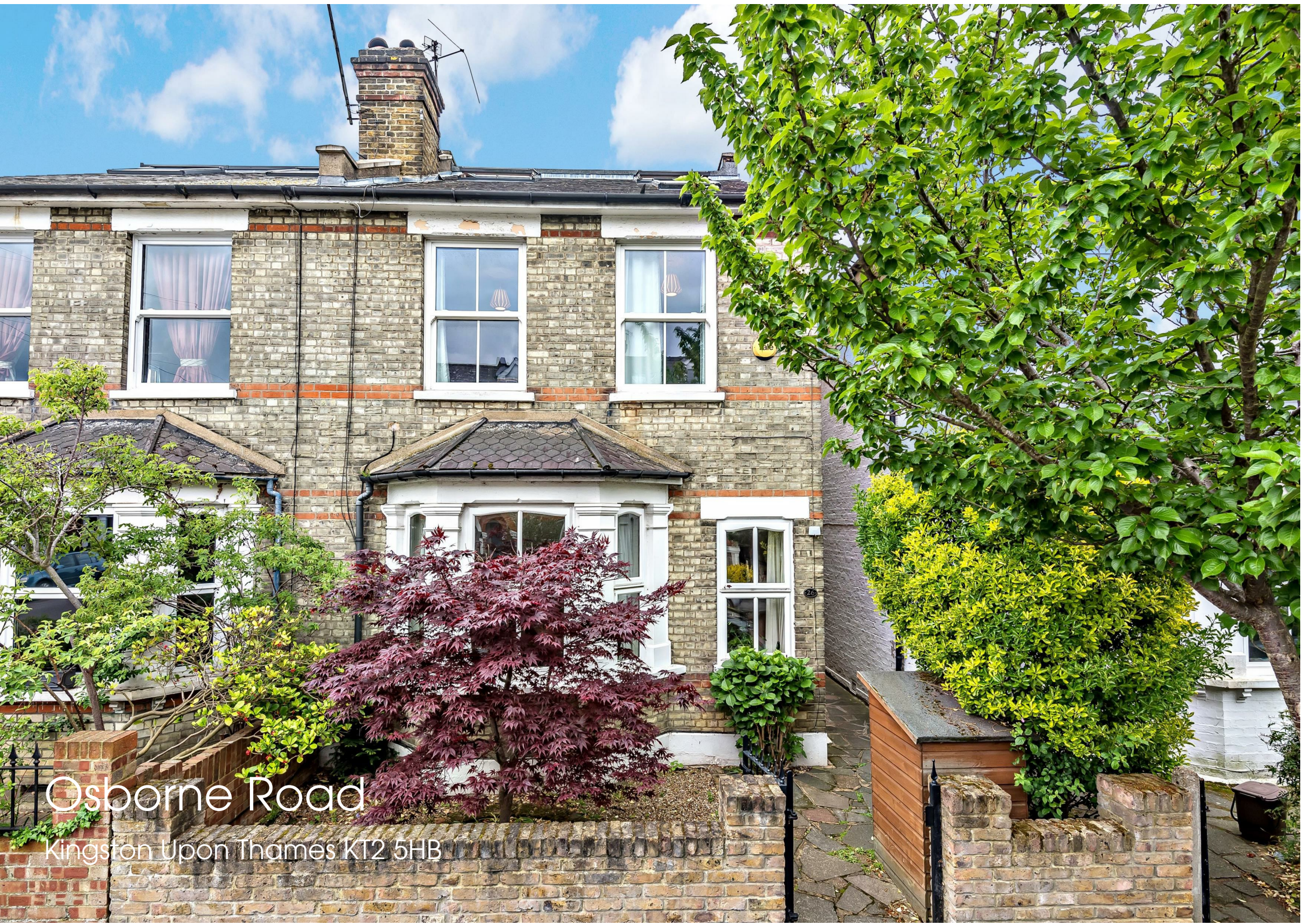
Osborne Road Kingston Upon Thames KT2 5HB